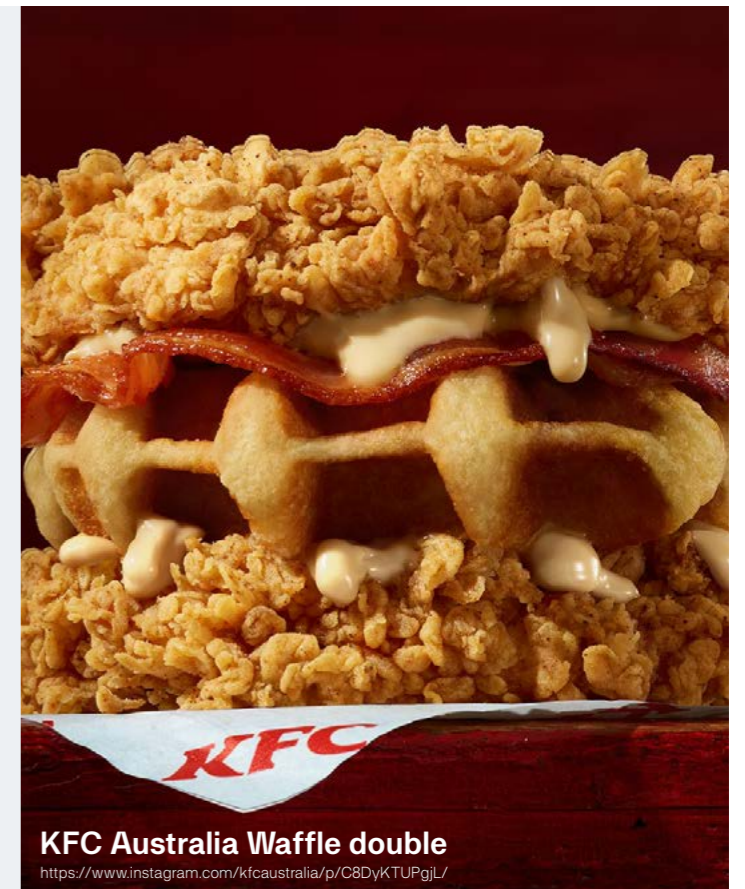
KFC Australia Waffle double

These innovations reflect evolving expectations, merging traditional flavours with new techniques to create extraordinary crispy, crunch culinary experiences.