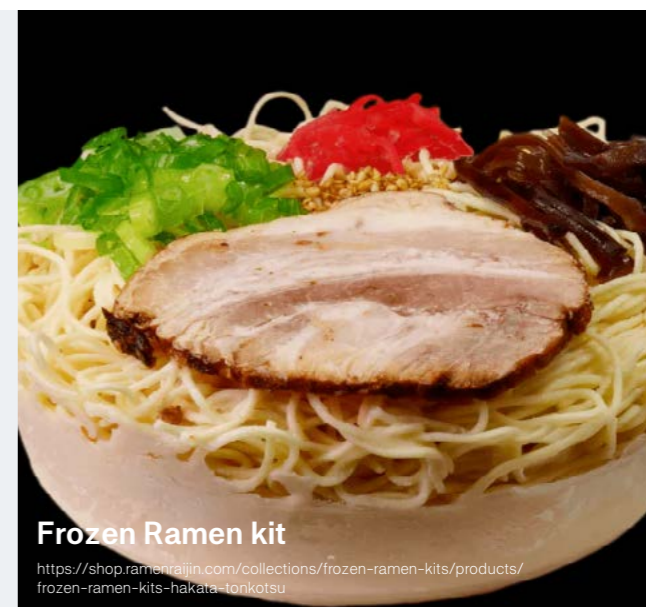
Frozen Ramen kit

https://shop.ramenraijin.com/collections/frozen-ramen-kits/products/frozen-ramen-kits-hakata-tonkotsu