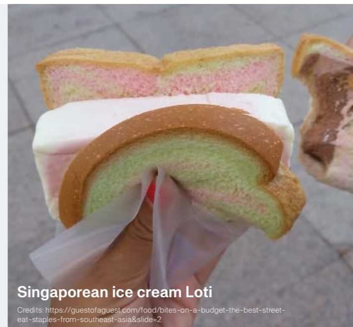
Singaporean ice cream Loti

Fermented foods, frozen desserts, cheeses, and butter are also incorporating more air for an airy, frothy, and creamy mouthfeel, as seen in innovations such as whipped feta, a lighter mouthfeel version of the cheese. Cotton candy has been doing this for years, and other sweets and confectionery will likely follow, along with salad dressings and sauces.