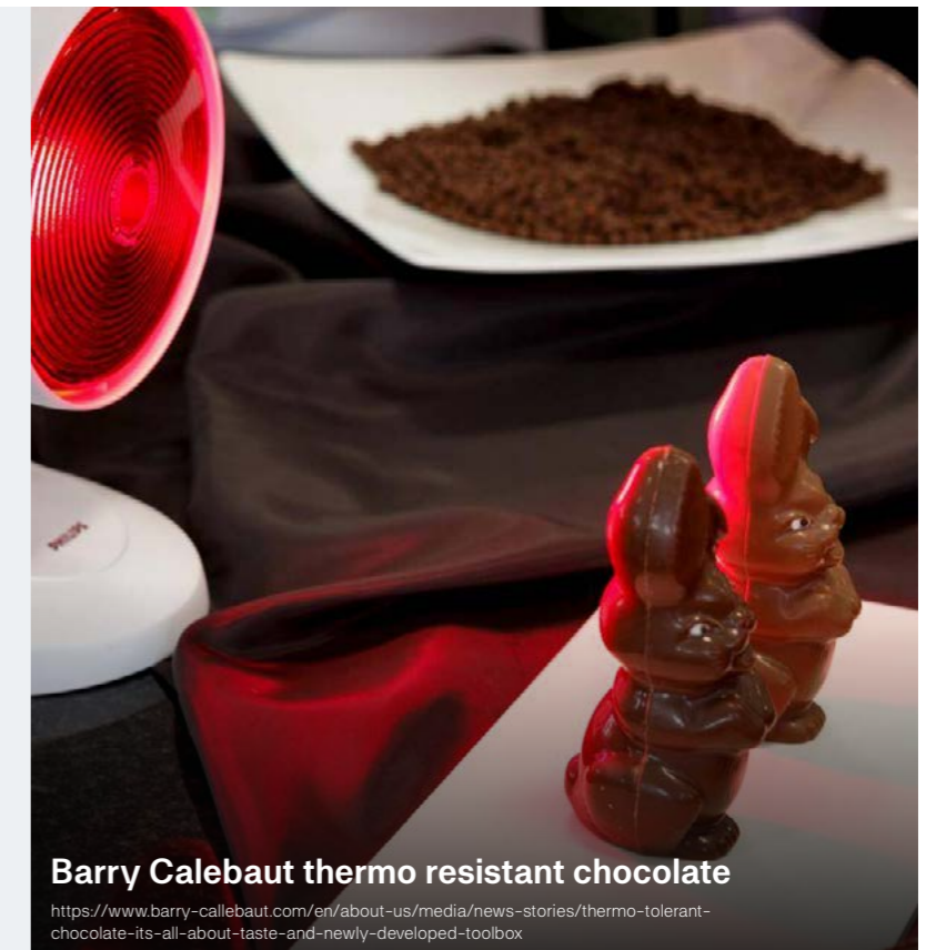
Barry Callebaut thermo resistant chocolate

Many retailers are lowering store temperatures to support on-shelf stability, though this introduces risks of new temperature extremes. Additionally, packaging innovations are emerging to help preserve food quality and make a point to communicate to customers about a product's freshness.