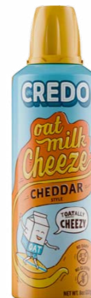
CREDO Oatmilk spray cheese

This means innovators must find ways to refine their skills in recreating the creamy richness of dairy, the juicy tenderness of meats, and the flaky textures of pastries. That requires skilfully combining plant proteins, fats and stabilisers to achieve the desired mouthfeel without sacrificing flavour.